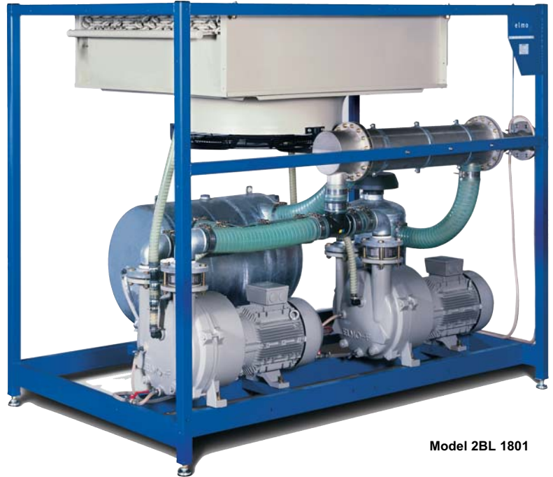
Model 2BL 1801